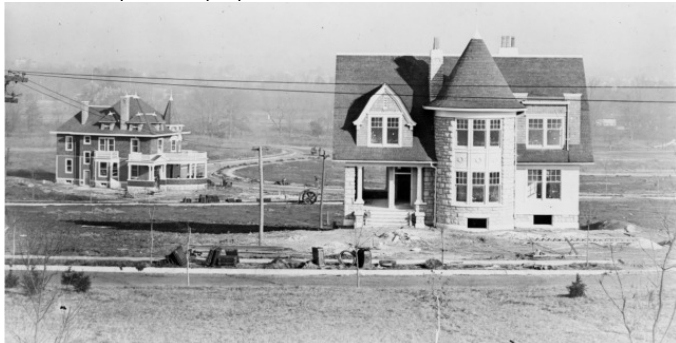
1906--Facing north, 6965 Princeton on the right and 6975 Cornell on the left.

Taken from http://history.ucpl.lib.mo.us/